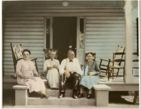
The Downs House Circa 1910