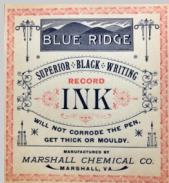
Marshall Chemical Company products

The FHPF is pleased to announce the second of a new series of talks entitled History Happy Hour . Each talk will focus on a different historical subject. The second talk, “ Bygone Businesses of Marshall ,” will feature three area businesses which no longer exist but contributed much to the fabric of the community. The talk will be divided into three segments, each given by a different presenter. The first business, Lone Pine Dairy , will recall the days of milk and other dairy products delivered to resident’s back porches, a service no longer available. Learn about the history of the dairy and its role in the community. The second segment will highlight Johnnie’s Grocery , its importance and role in Marshall. The third segment will feature the Marshall Chemical Company and the Klipstein family. Learn about Blue Ridge Washing Powder, Ink, Ball Blueing, and Carbona, a chemical still sold today but had its roots in Marshall. Don’t miss this second presentation on Sunday, November 3rd, 5-6 PM . The talk is free and open to the public. Seating is limited so come early.