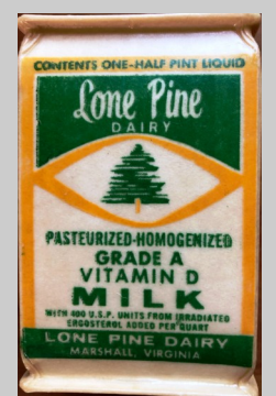
Lone Pine Dairy Milk Carton

The FHPF is pleased to announce the second of a new series of talks entitled History Happy Hour . Each talk will focus on a different historical subject. The second talk, “ Bygone Businesses of Marshall ,” will feature three area businesses which no longer exist but contributed much to the fabric of the community. The talk will be divided into three segments, each given by a different presenter. The first business, Lone Pine Dairy , will recall the days of milk and other dairy products delivered to resident’s back porches, a service no longer available. Learn about the history of the dairy and its role in the community. The second segment will highlight Johnnie’s Grocery , its importance and role in Marshall. The third segment will feature the Marshall Chemical Company and the Klipstein family. Learn about Blue Ridge Washing Powder, Ink, Ball Blueing, and Carbona, a chemical still sold today but had its roots in Marshall. Don’t miss this second presentation on Sunday, November 3rd, 5-6 PM . The talk is free and open to the public. Seating is limited so come early.